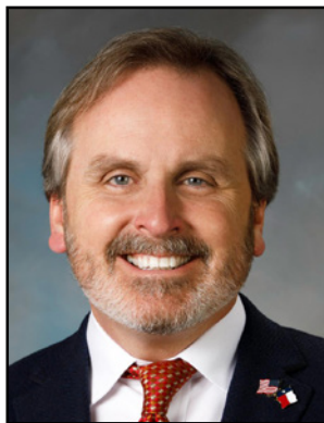
Bryan Hughes Texas Senator