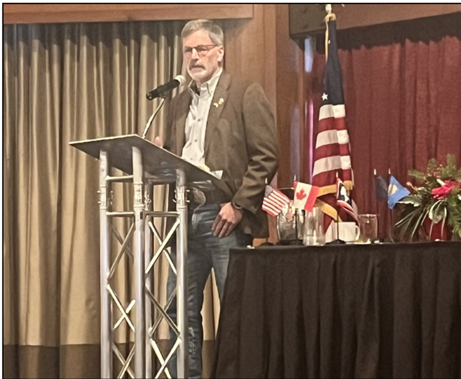
Closing out the 2023 Global Energy and Environmental Issues conference, Wyoming Governor Mark Gordon stressed the importance of carbon capture as a means to address climate change and how Wyoming could be a change leader in this effort.

company is prioritizing understanding the potential environmental and socioeconomic impacts of their operations and is committed to developing, maintaining, and operating projects in a responsible manner while adhering to appropriate standards that ensure the protection of the environment for future generations.